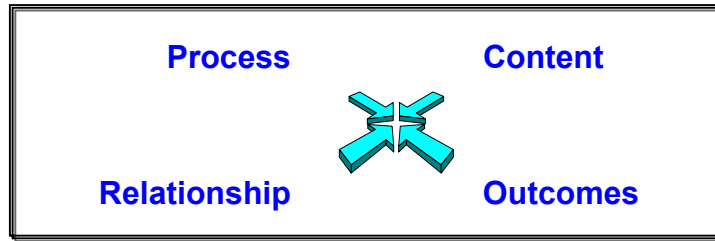
Figure 1: Four Facets of Coaching

Developing and nurturing the relationship between the leader and the coach is key. Both parties need to understand their individual roles and responsibilities vis-à-vis each other and the mechanics of how they will work together. The coach must be authentic, credible, trustworthy and seen as someone who can add value. The leader must also be trustworthy, demonstrating integrity and honesty in his or her words and actions.